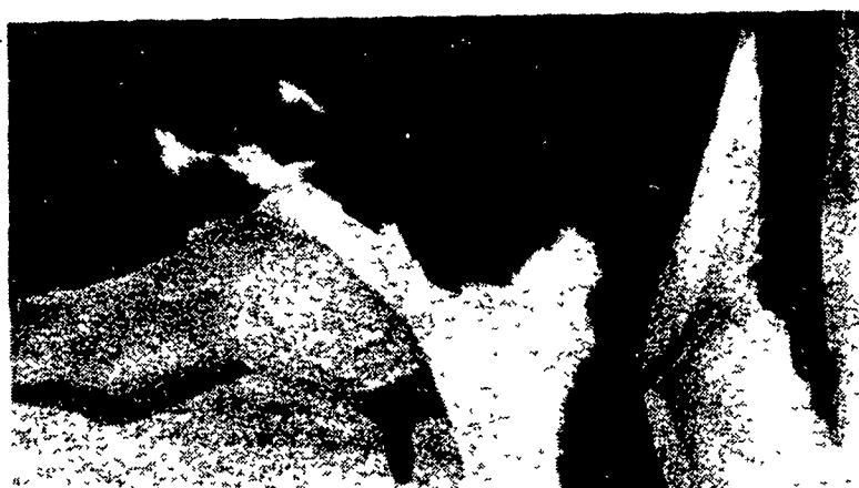
This is the excellent udder of the Romandale daughter, Count Crystan Madame. She is classified Excellent 94 with an excellent mammary.