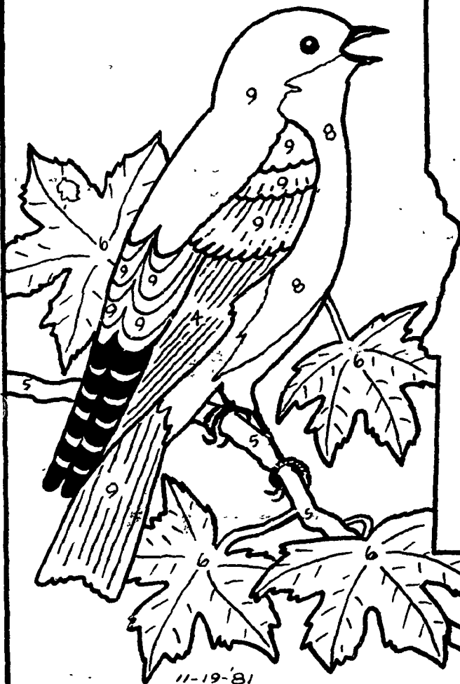
STATE BIRD MOUNTAIN BLUEBIRD

IDAHO. THERE ARE ONLY 13 STATES LARGER THAN IDAHO. "Eedah how" IS THE INDIAN WORD MEANING "THE SUN IS COMING DOWN THE MOUNTAIN." THE EARLY SETTLERS NAMED THEIR NEW HOME IDAHO. HELL'S CANYON, THROUGH WHICH THE SNAKE RIVER FLOWS, IS DEEPER THAN THE GRAND CANYON OF THE COLORADO. IN 1890 IDAHO BECAME THE 43RD. STATE TO JOIN THE UNION.