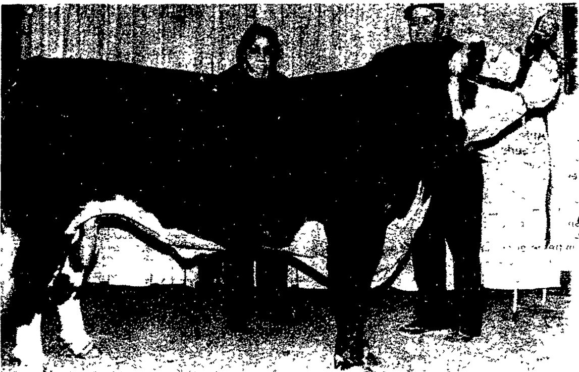
Schochary Ridge Farms exhibited the reserve grand champion Polled Hereford bull, SRF Ridge Vindicator, the second place 2-year-

purple ribbon again. The Montana-bred bull is owned by Spring Bottom Farm, Fairfield, Adams County.