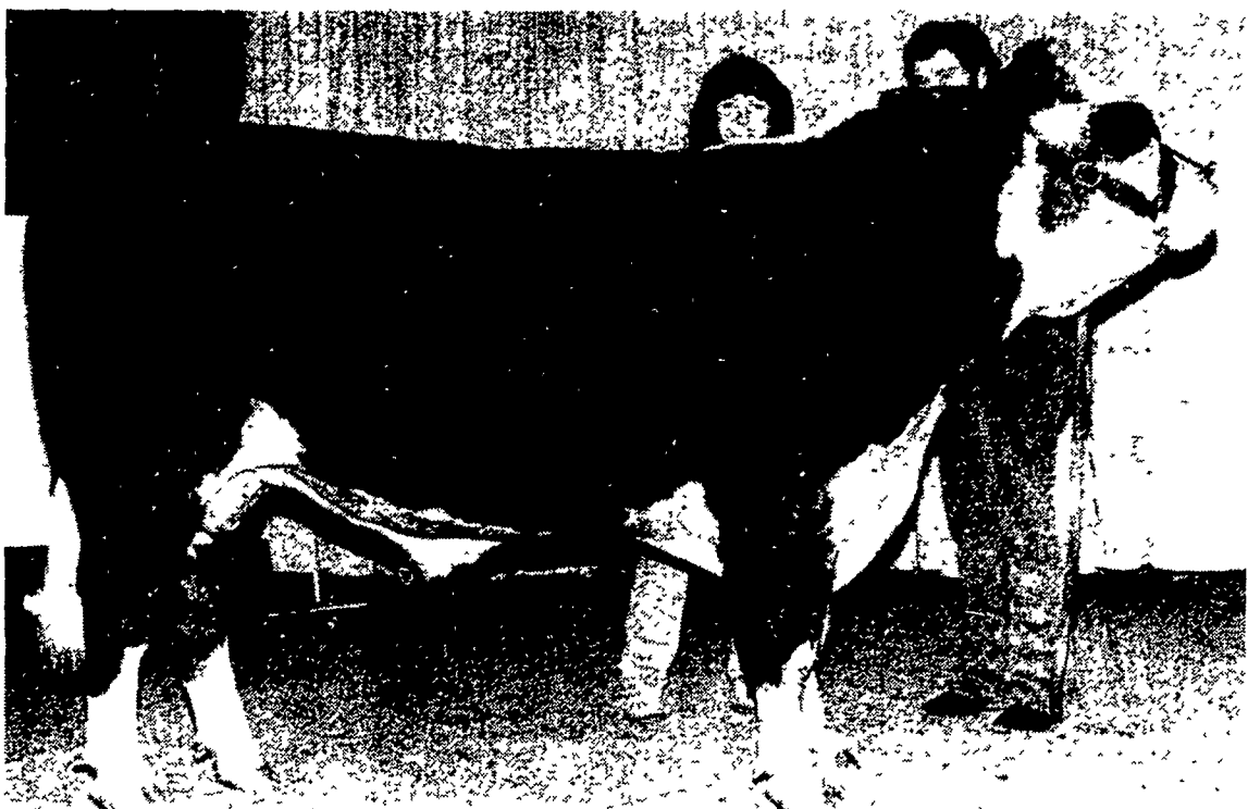
The grand champion Polled Hereford bull turned in a repeat performance. Hilger Special 415 was last year's Farm Show grand champ and came back as a 2-year-old to claim the

In the bull show, Spring Bottom continued to reap the purple rib-