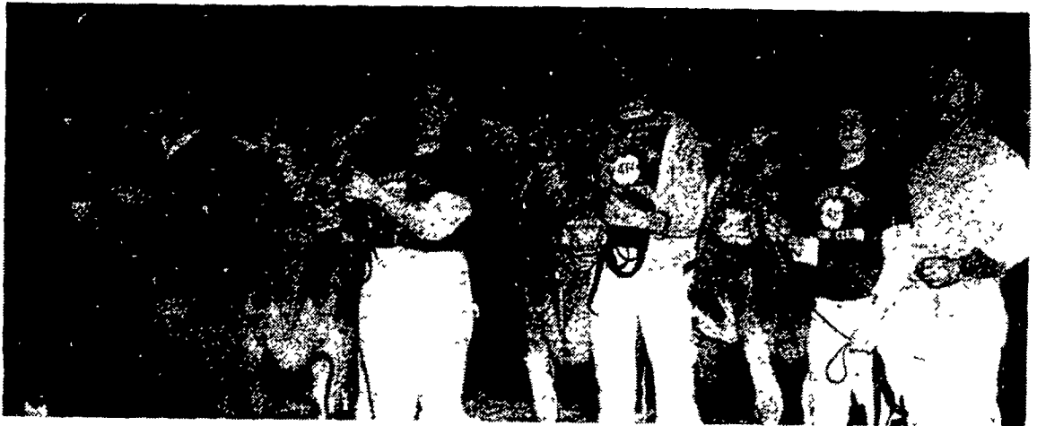
Members of Rutter Brothers dairy, York, are joined by some of their top Guernseys. The