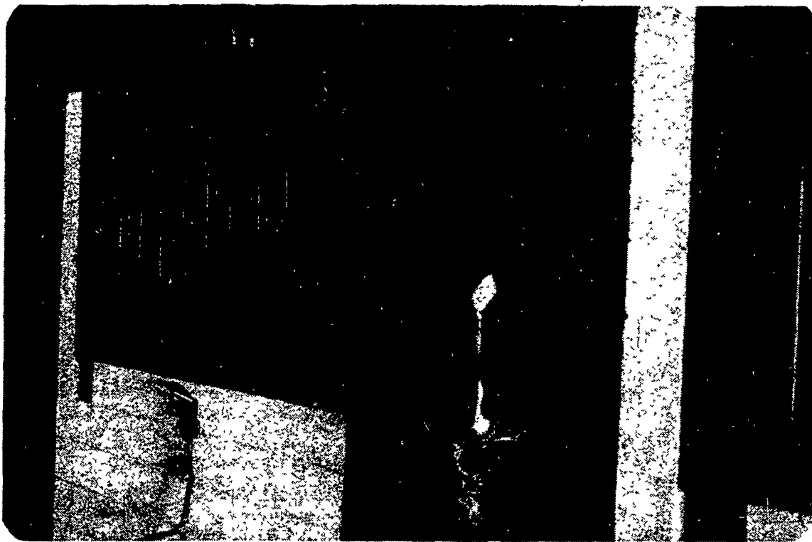
Maintenance Free Concrete Block Stalls

On Their New 22 Stall Training Barn w/a 4 room apartment