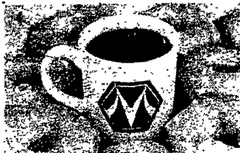
free coffee and donuts

Receive a free Morton Open House cap when you fill out the coupon below and bring it to any Open House and request a written quote on a new Morton Building; plus, go on a tour of nearby Morton Buildings. Remember, too, you'll receive an extra bonus of a free attractive weather vane with every building purchased. So, mark your calendar now and plan to join us at our Open House Days!