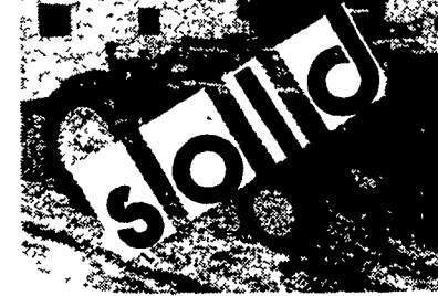
John Deere 2630 Diesel Independent PTO, 3 Pt. and Remote Control 1400 Hrs. PRICE... $10,750.00