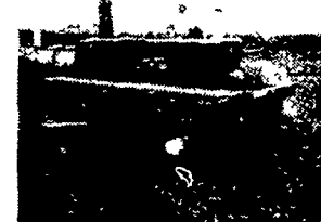
A.C. Air Planter No Till Like New w/Monitor $4,850.00