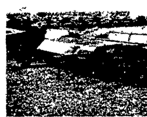
New Idea Cuditioner $1,450.00