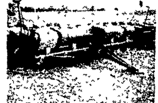
John Deere 1250 Six Row - Plateless Planter, Insecticide Attach., REAL SHARP $4,350.00