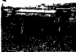
Oliver 13x7 Grain Drill S.D. $675.00