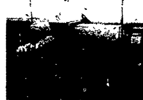
IH Air Planter Six Row w/Population Monitor, Insecticide REAL SHARP $2,650.00