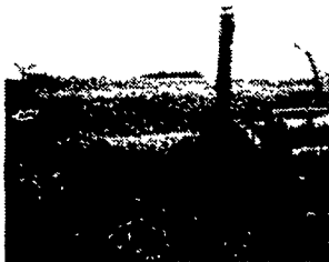
Gehl 6' Chopper $950.00