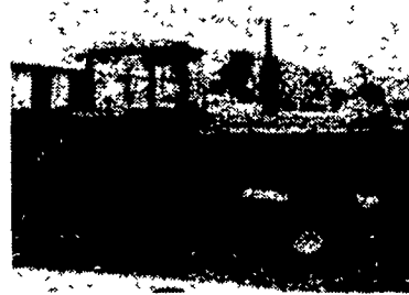
John Deere 4430 Quad Range, Sound Guard w/Radio & Tape, Air & Heat, Dual Wheels, Three Point w/Quick Coupler, Auxiliary Fuel Tank, Rear Weights, Dual Remote - 2170 Hours PRICE... $20,750.00