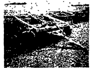
Taylor Way Disk w/Cushion Gangs Like New... $2,850.00