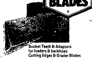
Bucket Teeth & Adaptors for loaders & backhoes Cutting Edges & Grader Blades