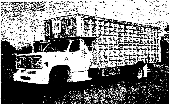
Aluminum Livestock Body

Manufacturer of All Aluminum Truck Bodies Livestock, Grain & Bulk Feed