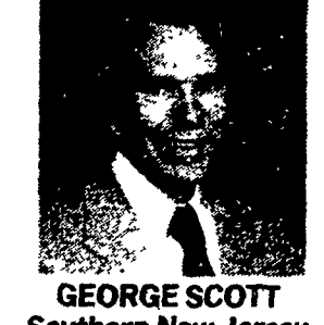
Southern New Jersey