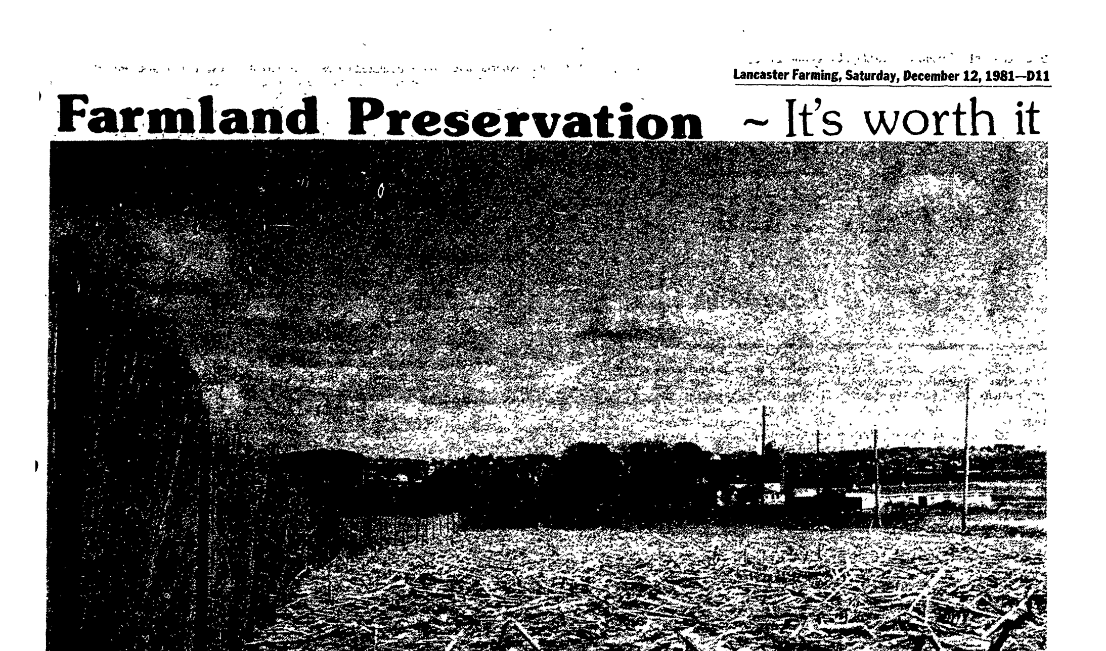
Kissel Hill, Lancaster County

This is another in a series of scenic photos of Pennsylvania farmland, as it appears today. And hopefully, as it will continue to appear tomorrow and beyond.