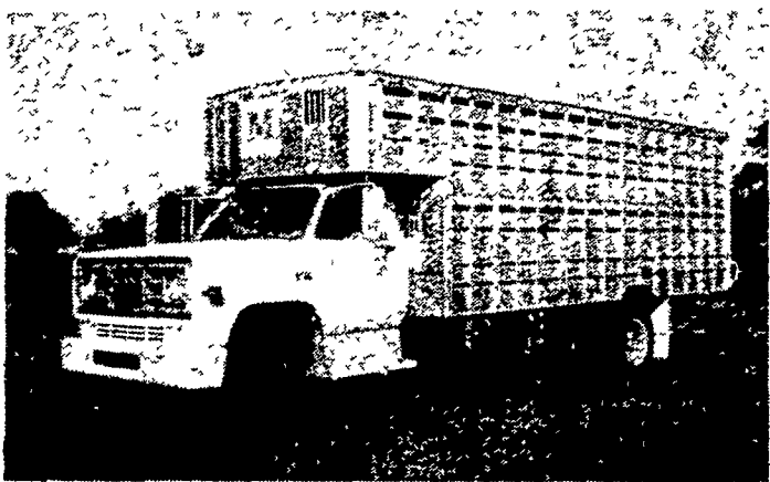
Aluminum Livestock Body

Distributor of TIMPTE Refrigerated Trailers Sales & Service Blue Ball, Pa. 717-354-4971