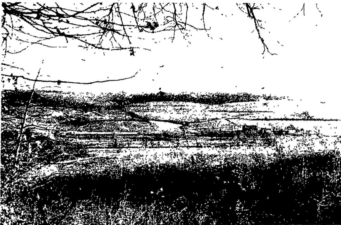
Farmers on these family operations that populate Green Valley feel that they're fighting to stop the burial of hazardous wastes, not mainly for their own lifetimes, but to protect the legacy to their children and grandchildren. Geologists studies say that a large aquifer, or underground water recharge system, lies beneath picturesque farmland.

—The proposed method of containment of hazardous waste is not a sound technique because in the final analysis all clays or artificial barriers eventually leak. Moreover, given the weight of overburden above the containment barrier and the resulting pressure head, leakage would accelerate.