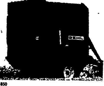
or making large round bales in the 2000 lb. plus legory the 1850 is your baler. It makes bales that e a full 6 feet in diameter and 61 inches wide. It s Jly the heavyweight among round balers.