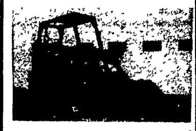
Perkins Diesel Power Engine Like New

Owattonna 1700 Skid Steer Loader with auxiliary hydraulic remotes Ready for work, 45 HP