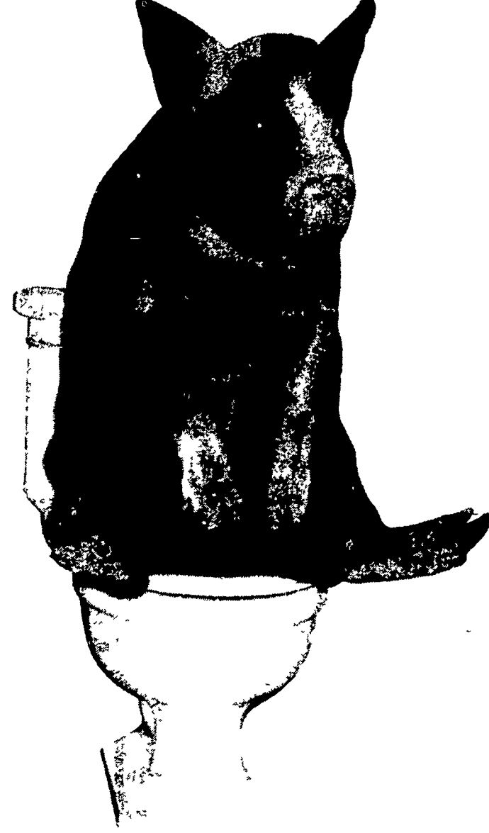
Lissco's waste handling & treatment design for confinement livestock systems is the next best thing to toilet-trained animals.