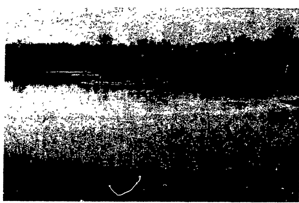
1170 Sow Farrow thru Finish Lagoon with Lissco Aeration