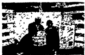
RESERVE CHAMPION MARKET SWINE BUYER HATFIELD PACKING, CO. - HATFIELD

Special Thanks Leesport Market & Auction Leesport Provider of Facilities