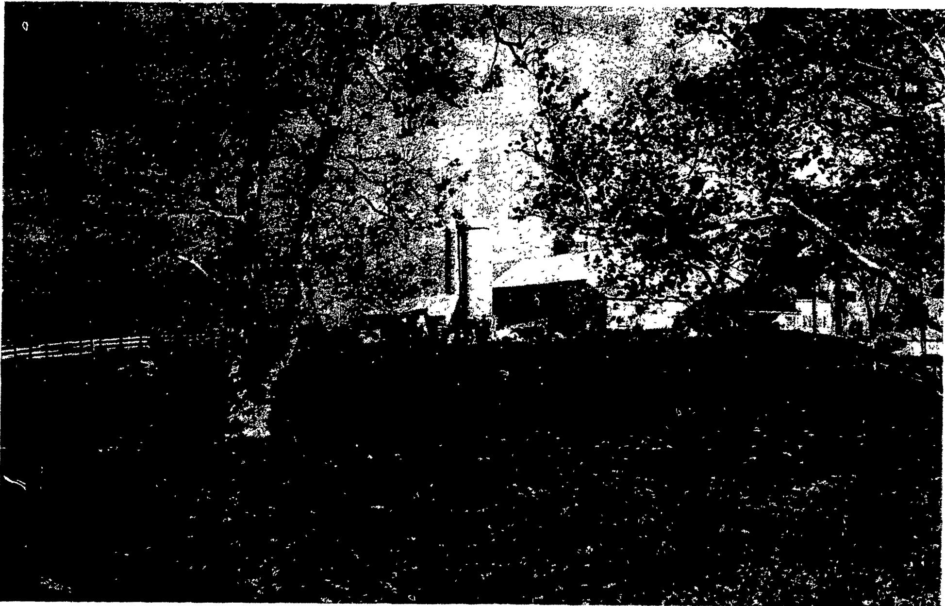
Eden Lancaster County