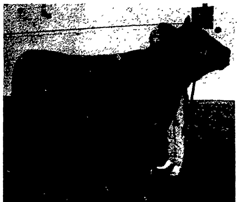
The grand champion Chianina heifer was shown by Dwayne Messick. The Blue Sky Jet Set daughter has earned numerous purple ribbons in her show road career, taking top honors at KILE and Eastern National last month.