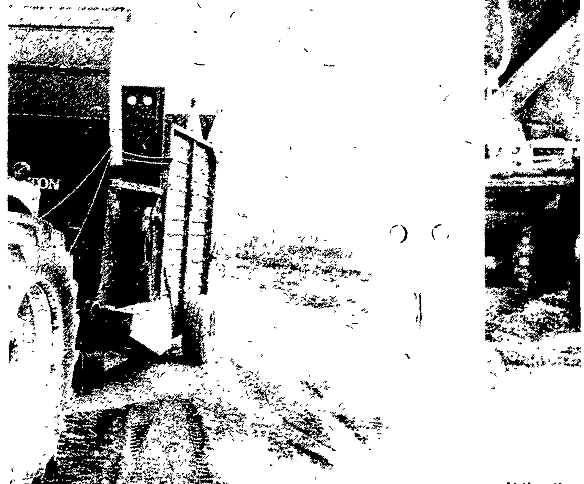
While corn picking takes place in the background the fodder shredder stands ready to spit out huge stacks of bedding. The Kopps share the money-saving machinery with a neighbor