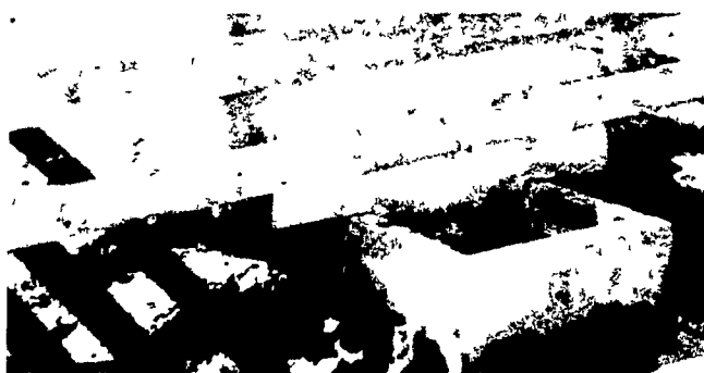
Pressure System Installation