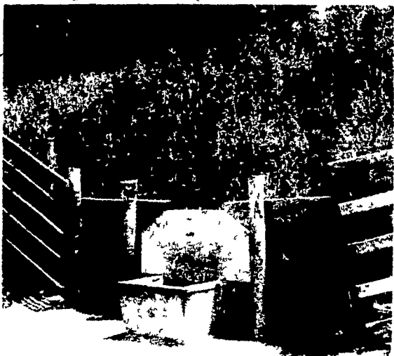
Pond Bank Installation