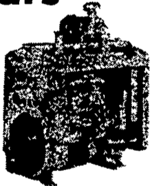
Closed Power Unit

Ideal for shops, agricultural generator sets, equipment, etc.