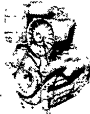
2 Cyl. F2L-912

SALES & SERVICE FOR: LISTER, PERKINS & DEUTZ DIESELS