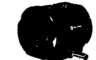
DE LAVAL STERLING VACUUM PULSATOR Most dependable vacuum pulsator on the market today.