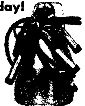
Easy-to-Handle 55 lb. Pails