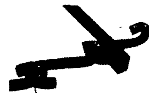
Ibberville Double Hook Chain

Massive 1" diameter - Heat Treated for Long Wear Many years of experience in Canada Recognized For Long Wear