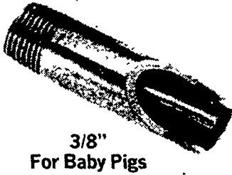
3/8" For Baby Pigs