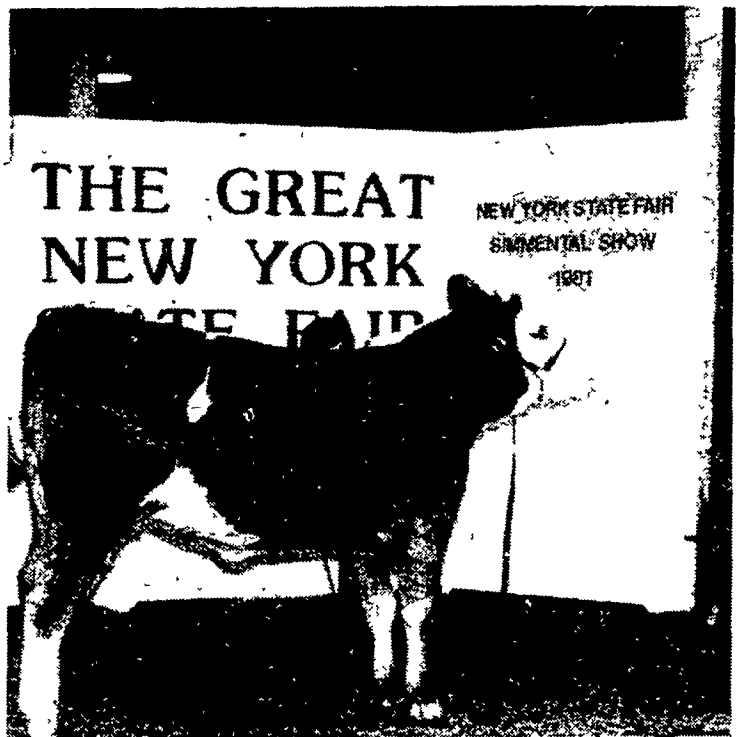
Linden Farms, Lagrangeville, N.Y. exhibited the grand champion female at the 1981 New York State Fair held recently in Syracuse.