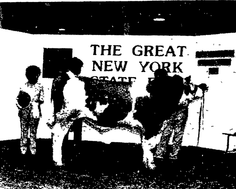
Whitney Hills Simmentals, Wolcott, New York, exhibited the reserve grand champion bull and received the premier exhibitor award.