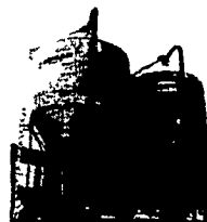
Today there's no need to put more nutrients in your bins than your hens need.

The Agway Daily Nutrient Intake (DNI) feeding program gives your birds the nutrients they need for maximum production at the lowest possible cost. The simple and efficient DNI system prevents overfeeding of expensive protein while meeting your hens' daily requirements for amino acids and other nutrients.