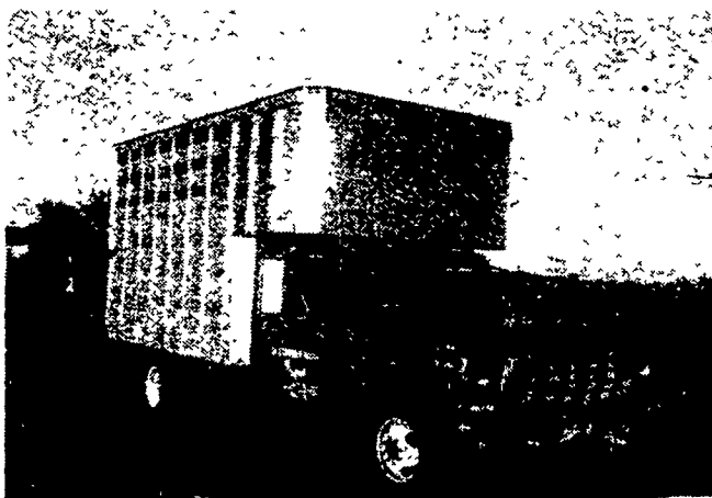
1978 Ford Truck with 11-ft. Eby Livestock Box with overshoot, V-8 engine, AM-FM radio, good tires, current inspection.

1971 F-700 Ford Truck with 22 Ft. Bed Will Be Sold Friday Evening