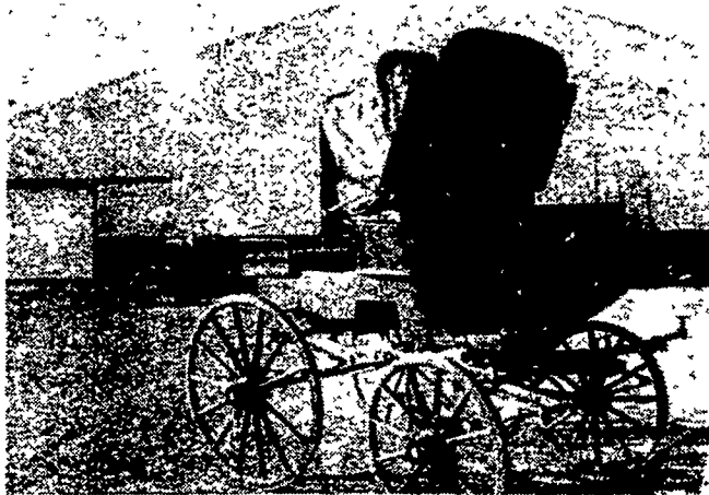
Stanhope Mail Phaeton, all original condition. By Henry Hooker & Co.