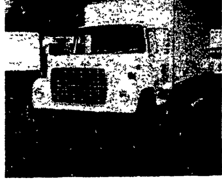
1974 LN 600 Ford - 20 ft. Van body - roll up rear door - side door - (3) to choose from.