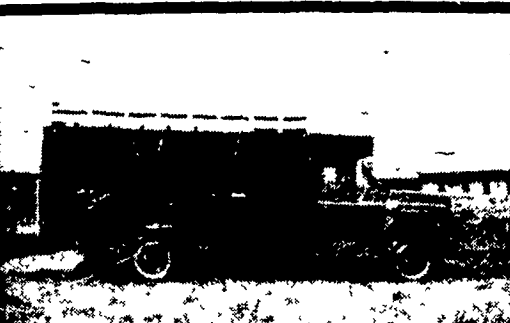
1978 GMC CATTLE TRUCK 15 ft. bed, V8, 350 Engine, 6000 Series 717-529-2614