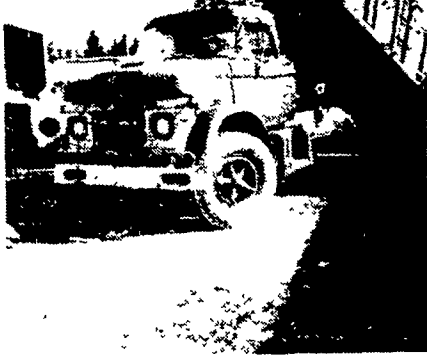
1968 F 800 Ford, 5 + 2, A/B - 16 ft. grain body - GVW 33,000, also 4 others to choose from.