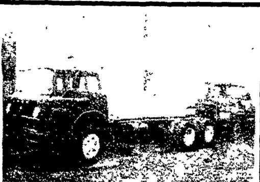
1971 Ford C8000, 225 cat. Power steering, good tires, triple frame, 1 1/2 ft. frame. Good condition $10,500