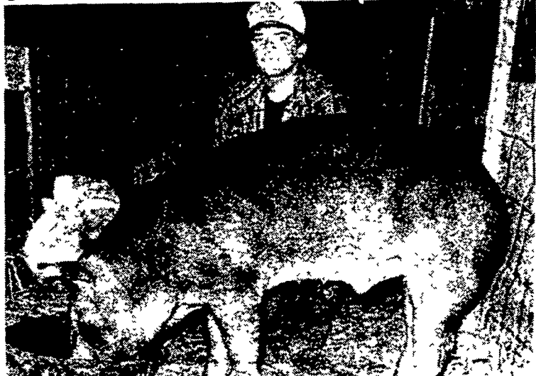
Terry Snyder, Hamburg, showed the reserve champion market hog.