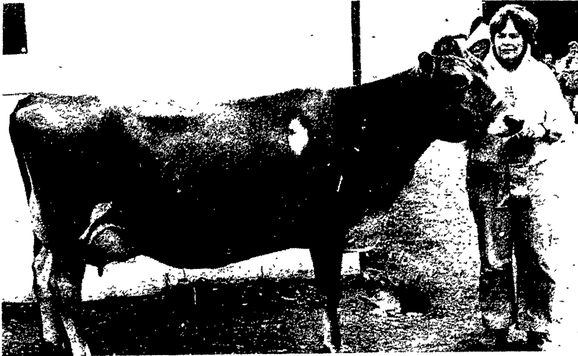
Top-O-Hill Special St. Patty chalks up another win for Mildred Seed's scrapbook. The reserve grand champion, an aged cow, is due in April to Samson.