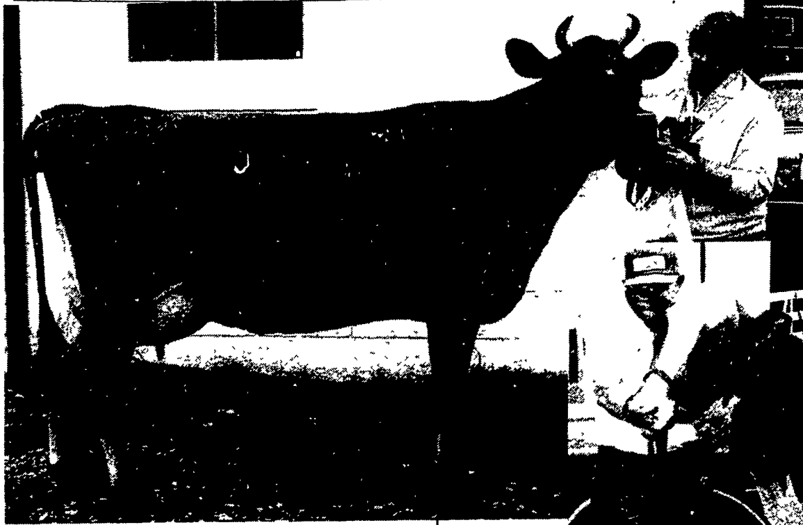
Mildred Seeds, one of the few Jersey breeders with a horned herd, is at the halter of her grand champion, Top-O-Hill Milestone Tempty. The 2-year-old Milestone daughter is out of Top-O-Hill Special Tasty.