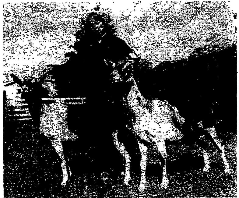
Roberta Molara, Dornsife, exhibited the reserve grand, front, and grand champion Alpine goats at last week's Gratz Fair goat show.