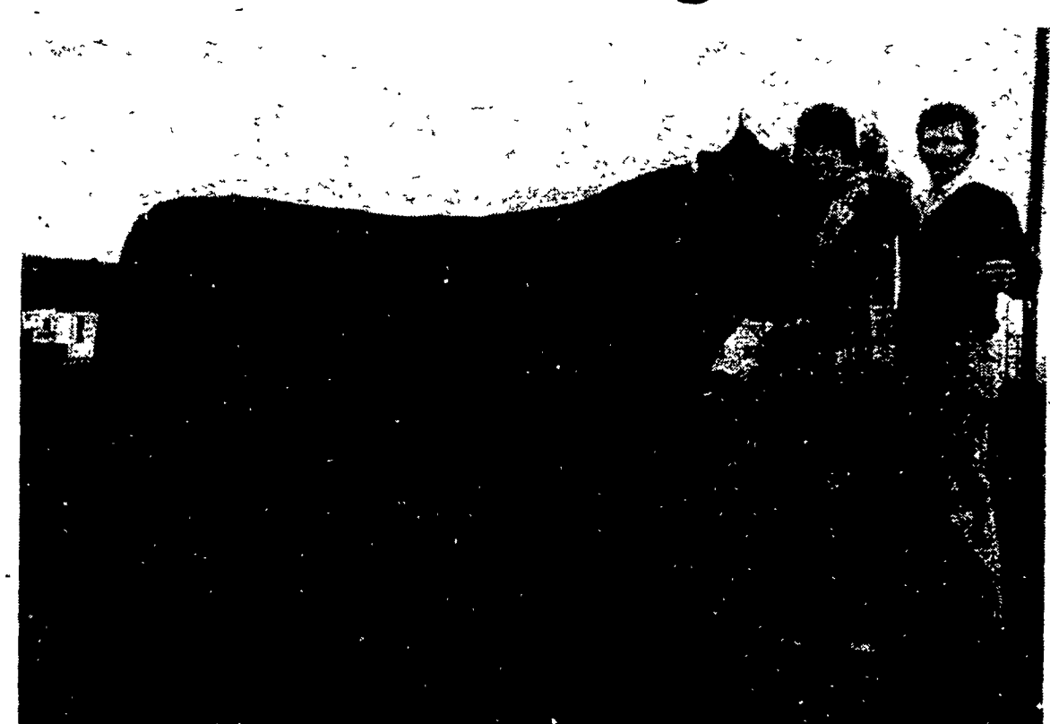
1130-pound steer to the grand championship here at Gratz Fair on Wednesday. Making the