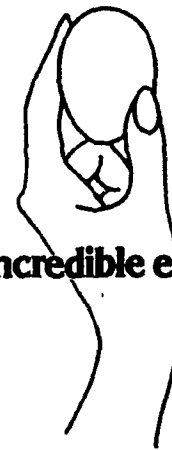
The incredible edible egg