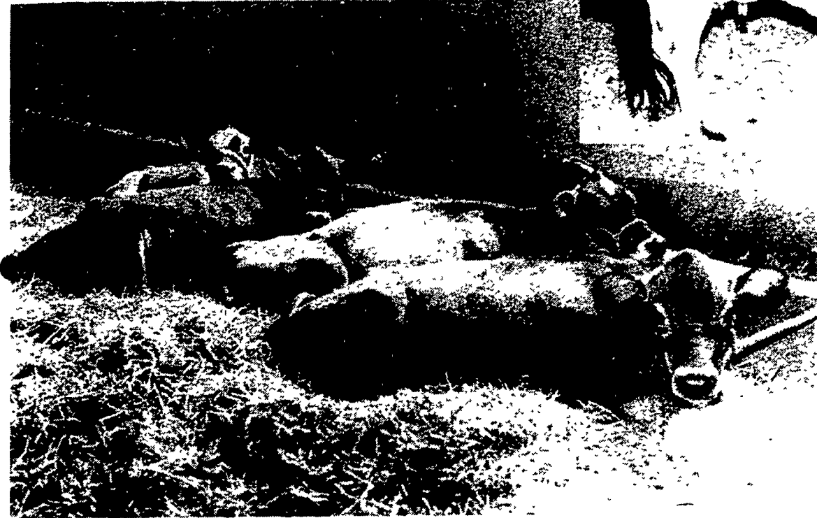
Four of six Pot of Gold heifers, which averaged $1,060, stretch out after the State Jersey sale before being hauled to their new homes. Junior Jersey members that purchased the three heifers that make the highest production on their first lactation, will divide 25 percent of the Pot of Gold profits from Saturday's sale.