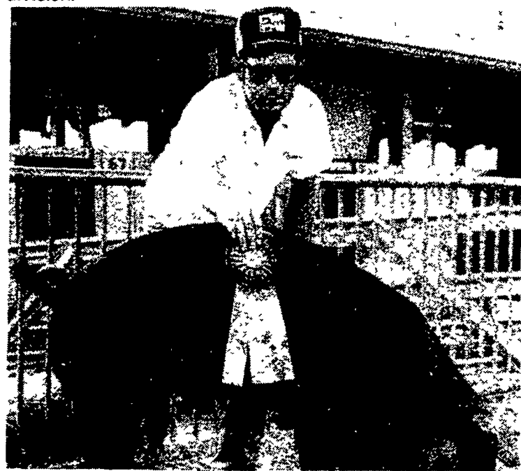
Named the champion Duroc barrow, and reserve champion barrow overall, was this market entry of Bankert's.