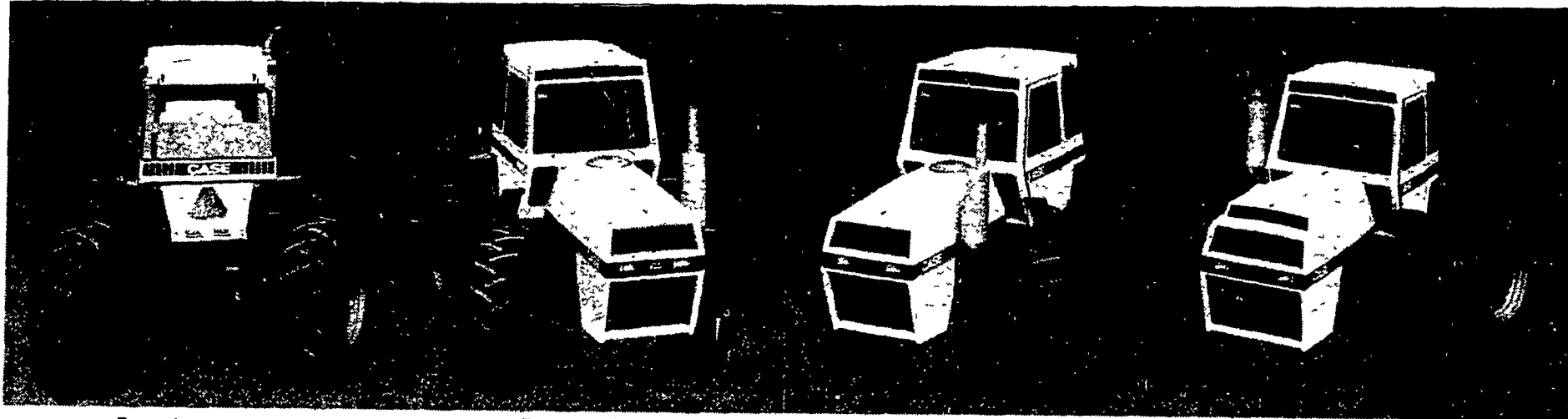
Rear wheel steering

Offers valid September 1 thru October 31, 1981.