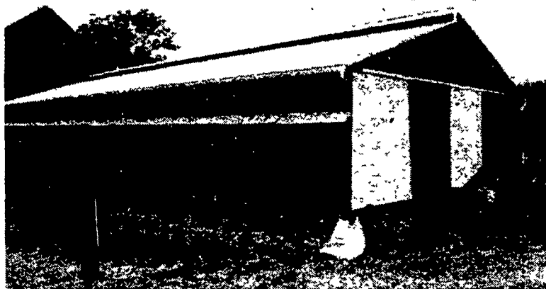
FREESTALL BARN ADDITION