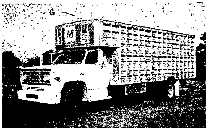
Aluminum Livestock Body

Distributor of TIMPTÉ Refrigerated Trailers Sales & Service Blue Ball, Pa. 717-354-4971