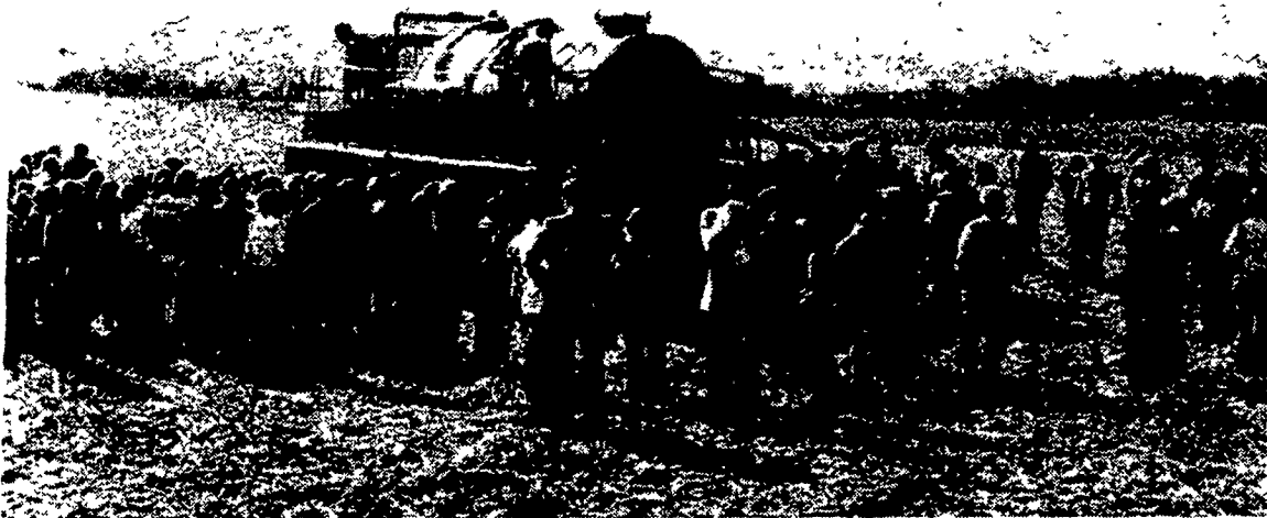
Participants watch as sludge application equipment injects sludge into the soil, a process which both conditions the soil and controls odors.

For additional information and pre-registration for the seminar-demonstration program, contact the Dauphin County Conservation District at 717/652-7048 or the Dauphin County Extension Office at 717/652-8460.