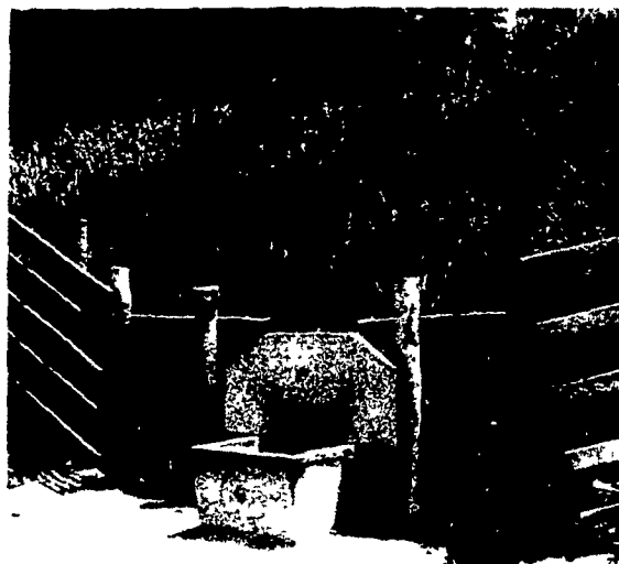
Pond Bank Installation