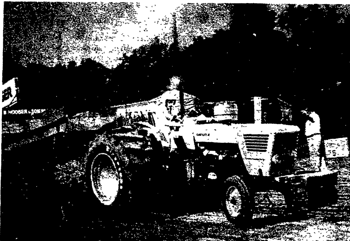
Tim Stauffer, of New Holland, places second with "Underdog" in 7000 super stock.