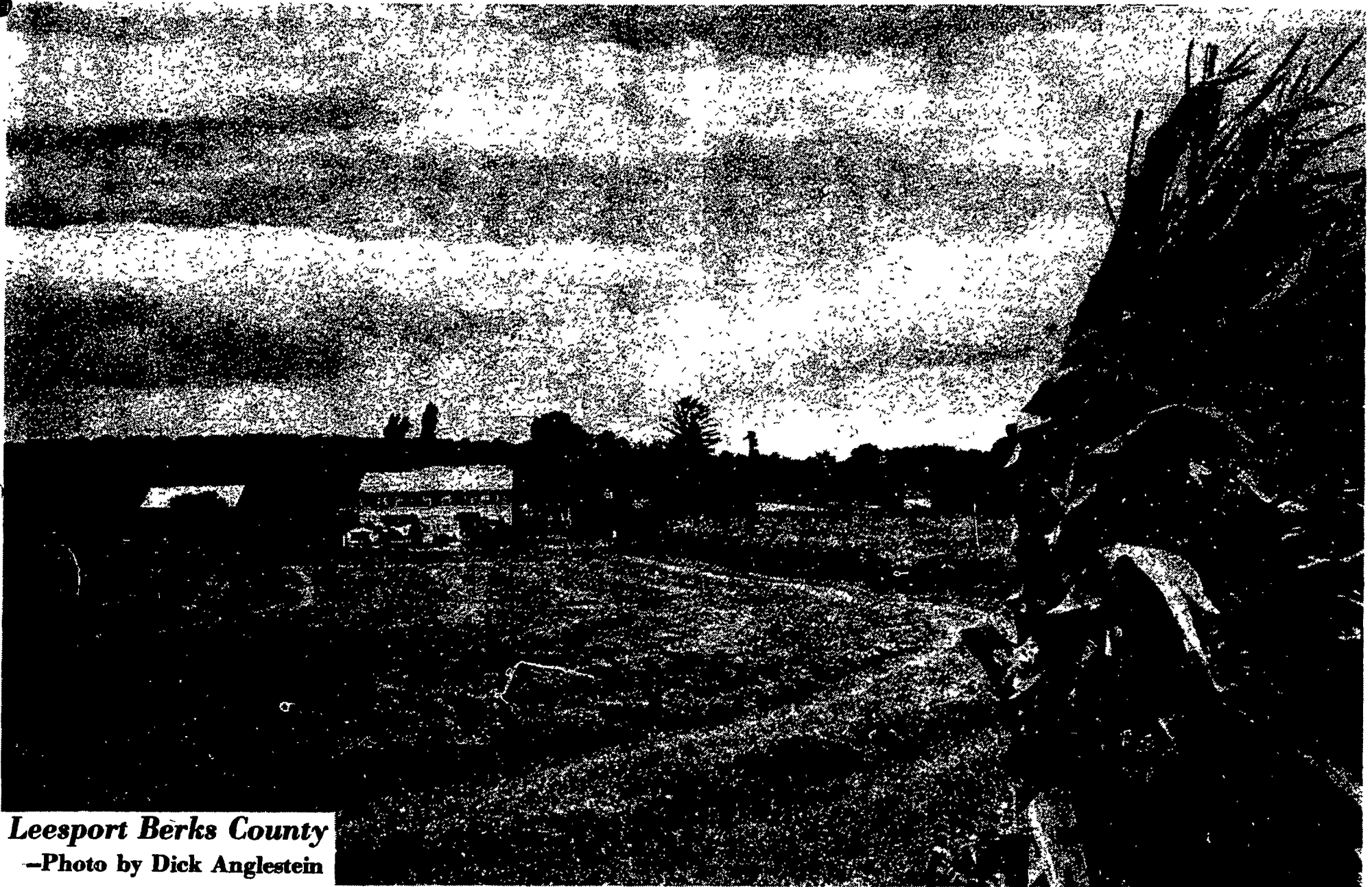
Leesport Berks County