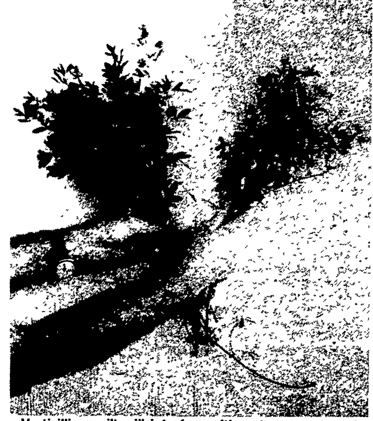
Verticillium wilt will interfere with water movement in a healthy alfalfa plant, left, and cause withering and eventually death as depicted by infected plant, right.

"We're not sure what we're going to have yet but it looks like we're ahead of it.