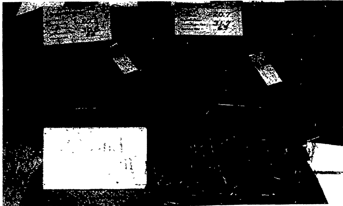
The Grand Champion, left, and Reserve Grand Champion hay samples were both submitted by Jay McCarrell of Eighty-Four at the 1981 State Hay Show held during Ag Progress Days. Both samples are partially field cured plus heat dried with no hay preservative.