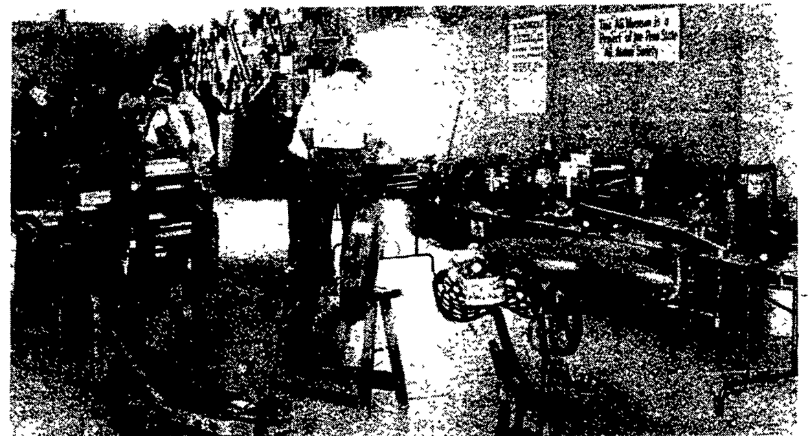
The popular Pasto Museum, opened for the first time last year, once again offered spectators fews and memories of yesteryear.