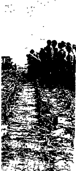
ors draw near the corn ook.