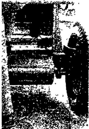
ith passing glances of and.