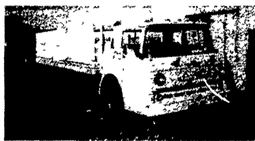
FORD C750 18 ft. dump, Air Brakes, 26,000 Gross, Good Cond. $4900.00 Chester County 215-269-3442