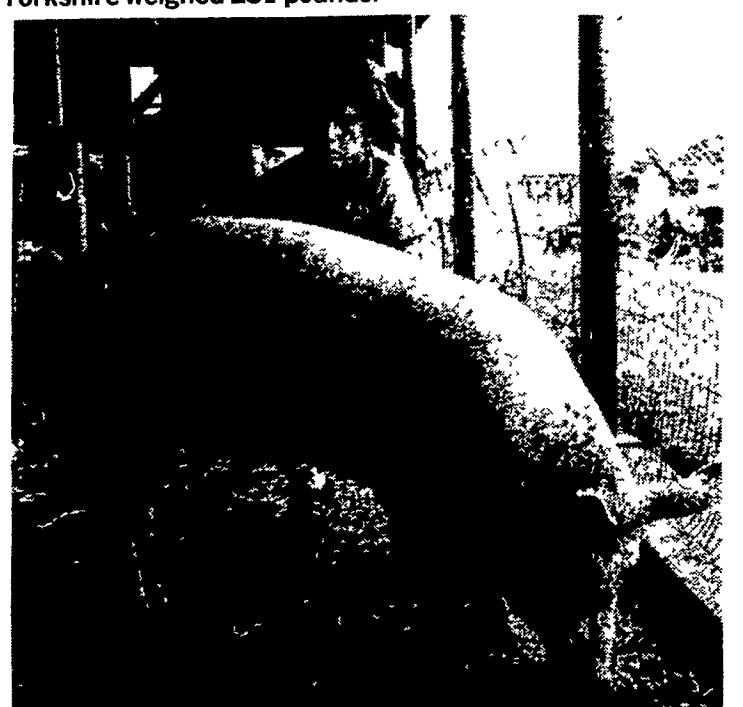
Jim McCauley, 13, of New Tripoli, showed the reserve grand champion market hog, the second place heavyheavyweight.