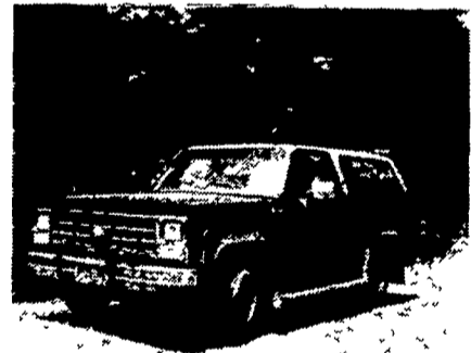
1980 Chevy Blazer fully equipped with air conditioning and only 10,000 miles Like new