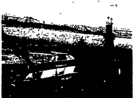
New Holland Forage Harvester Model 892 with 2 row corn head Used less than 10 hours, end of season purchase and like new