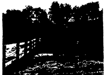
New Holland Tub Grinder (Model 393) bought new in 1980

Also selling a New Idea Manure Spreader (Model 245) New in 1980 with tandem flotation tires. Also a New Holland Bale Transport Wagon - 27 ft. five bale capacity for large round bales; Also a NH Forage Blower (Model 27) purchased in 1978; also Surge Milker pump with 5 horse motor. SUNSET 550 Gal. Bulk Milk Tank; Also Chore Boy Double Six Parlor Equipment - 12 feed units - 6 milk tanks.