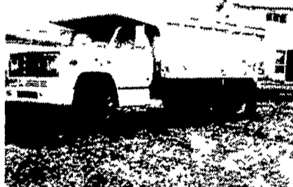
1977 CMG Truck Model 6000 V-Eight, 25,000 GVW with 15 foot Aluminum dump bed and only 17,000 miles