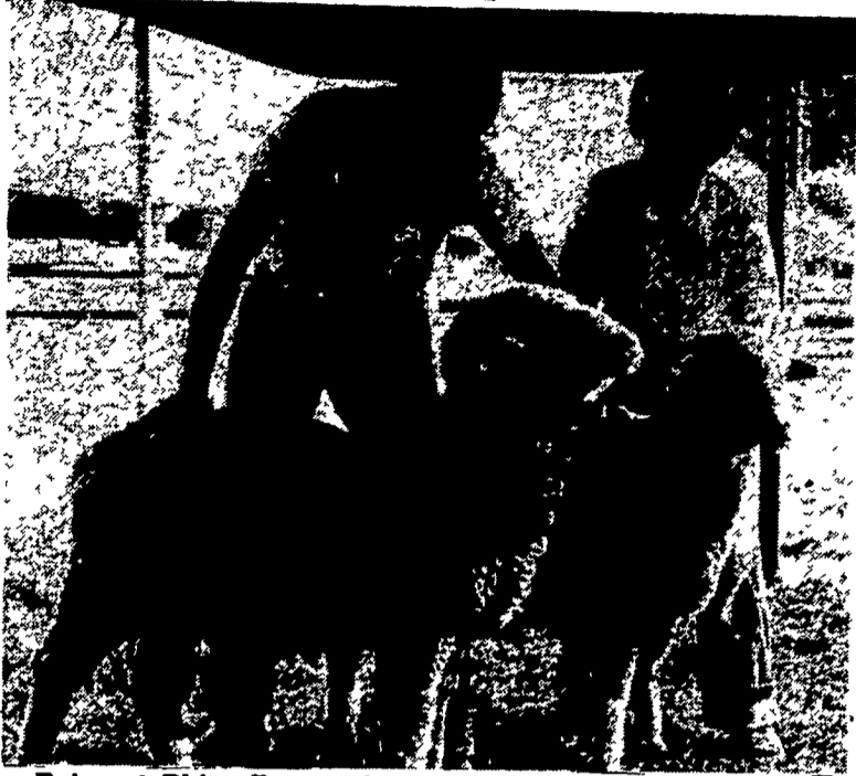
Belmont Ridge Farm exhibited the champion Merino ram and ewe, the oldest breed of sheep.