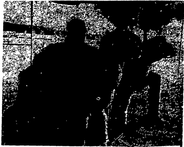
The champion Rambouillet Ram and Ewe were shown by Pine Haven-Farm, Newville.