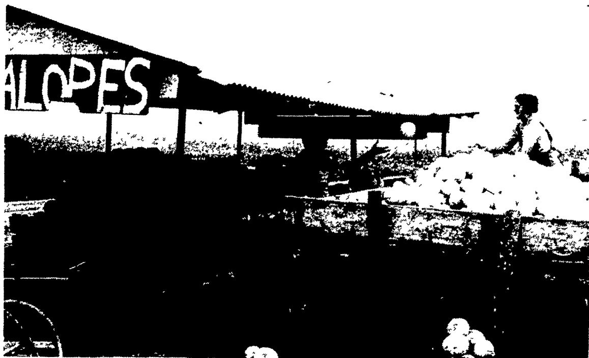
Numerous roadside stands are still found along Rt. 322 between Hinkletown and Blue Ball selling their own small mountains of melons. Here, two young ladies play "catch" and unload a wagon.

Honorable K. Leroy Irvis, State House Minority Leader, will keynote a luncheon for all interested members of the farm community, Wednesday, August 26 at the Fargus Township Lion's Club, Pine Grove Mills.